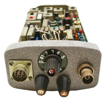
Front panel view of Volzhanka.