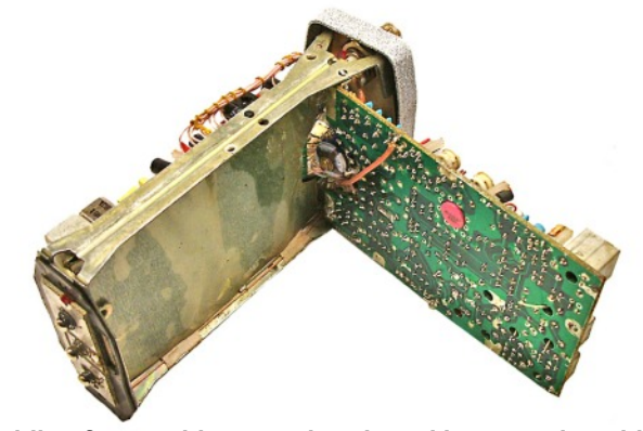
Folding frame with transmitter board in opened position.

At the time of preparing this chapter no further details of the Volzhanka could be found. Any additional information is welcome, particularly confirmation of frequency range, organisation, country of manufacture and purpose.